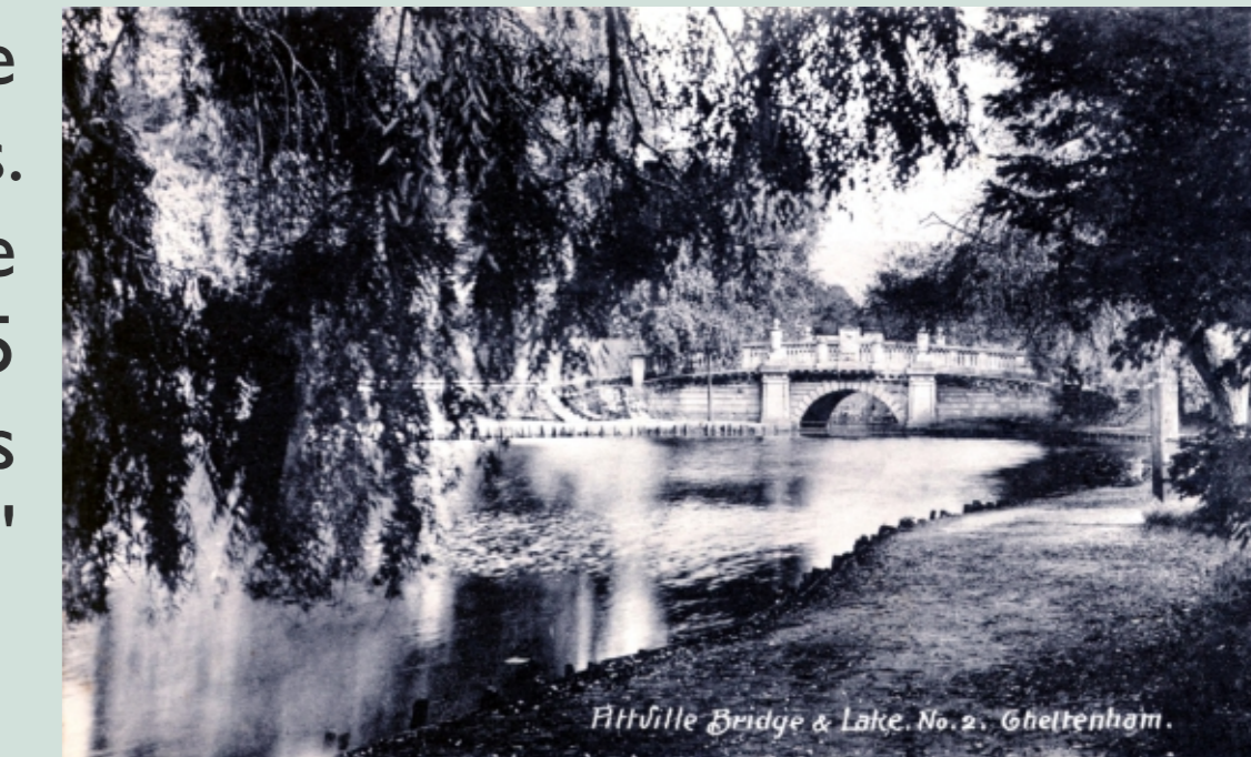
Pittville Lake and East Bridge, postcard circa 1910

Wyman's Brook was dammed to form the Upper Lake, as it was known from the 1890s. The lake and two stone bridges follow the original plan of 1826. George Rowe's 1845 Illustrated Cheltenham Guide noted that its banks were 'overhung with weeping willows' with 'a gravel path winding along its margin'.