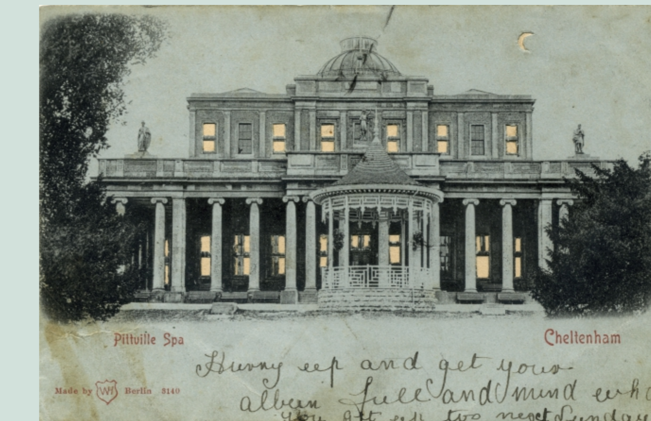
Bandstand in front of Pump Room, postcard circa 1900

By 1888 the Pump Room was not financially viable, and in 1890-91 Cheltenham Borough Council purchased the building and the 44 acres of surrounding gardens for £5,400 from the County of Gloucester Bank. In 1891 Pittville Gardens were formally opened to the public. A circular bandstand had been built directly in front of the Pump Room by December 1900, but was moved to its present site the following year, allowing a clearer view of the spa building. The Cheltenham branch of the Royal Air Force Association (RAFA) funded a £6,000 restoration of the bandstand in 1994-95, and contributed to further restoration in 2010 following fire damage.