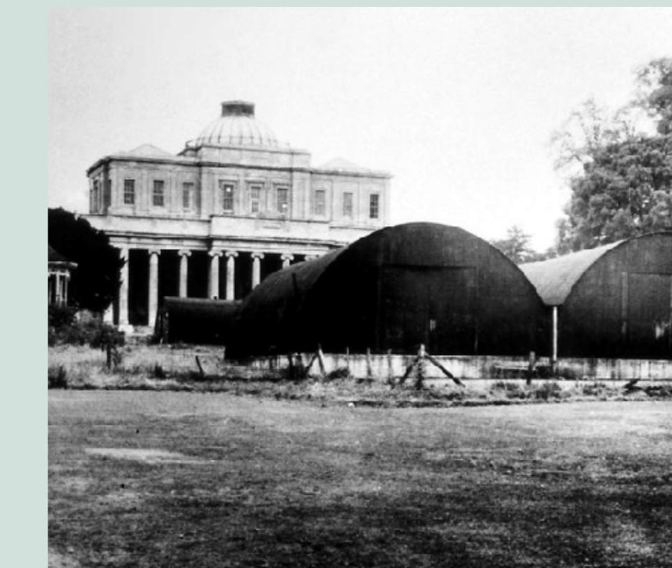
Nissen huts in front of Pump Room, photograph mid-1940s

The already-decaying Pump Room was commandeered for use as a US Army storage depôt during the Second World War, from 1942. The area of grass in front of the Pump Room was covered by Nissen huts and barbed wire. By the time the military left, the Pump Room dome was only held up by the plaster, and the timbers had been eaten away by dry rot. Under threat of demolition for many years, Pittville Pump Room was fortunately saved for the town. After extensive restoration, it was re-opened by the seventh Duke of Wellington in 1960.