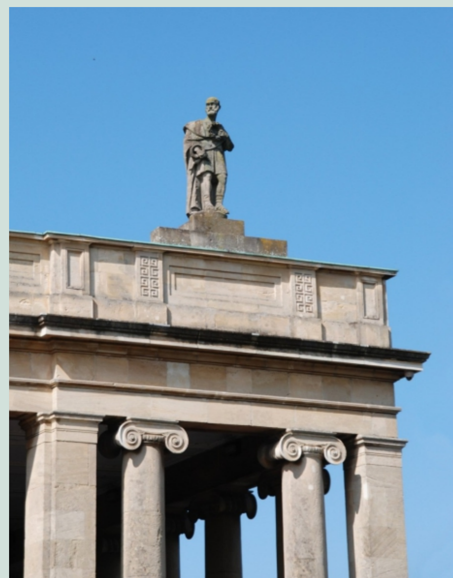
Statue of Greek physician, Hippocrates (circa 460-370BC), 1965 replica

The Pump Room, opened in 1830, was designed by architect John Forbes, and is inspired by the Temple of Ilissus in Athens, with Ionic columns on three sides and a small, beautifully-proportioned dome.