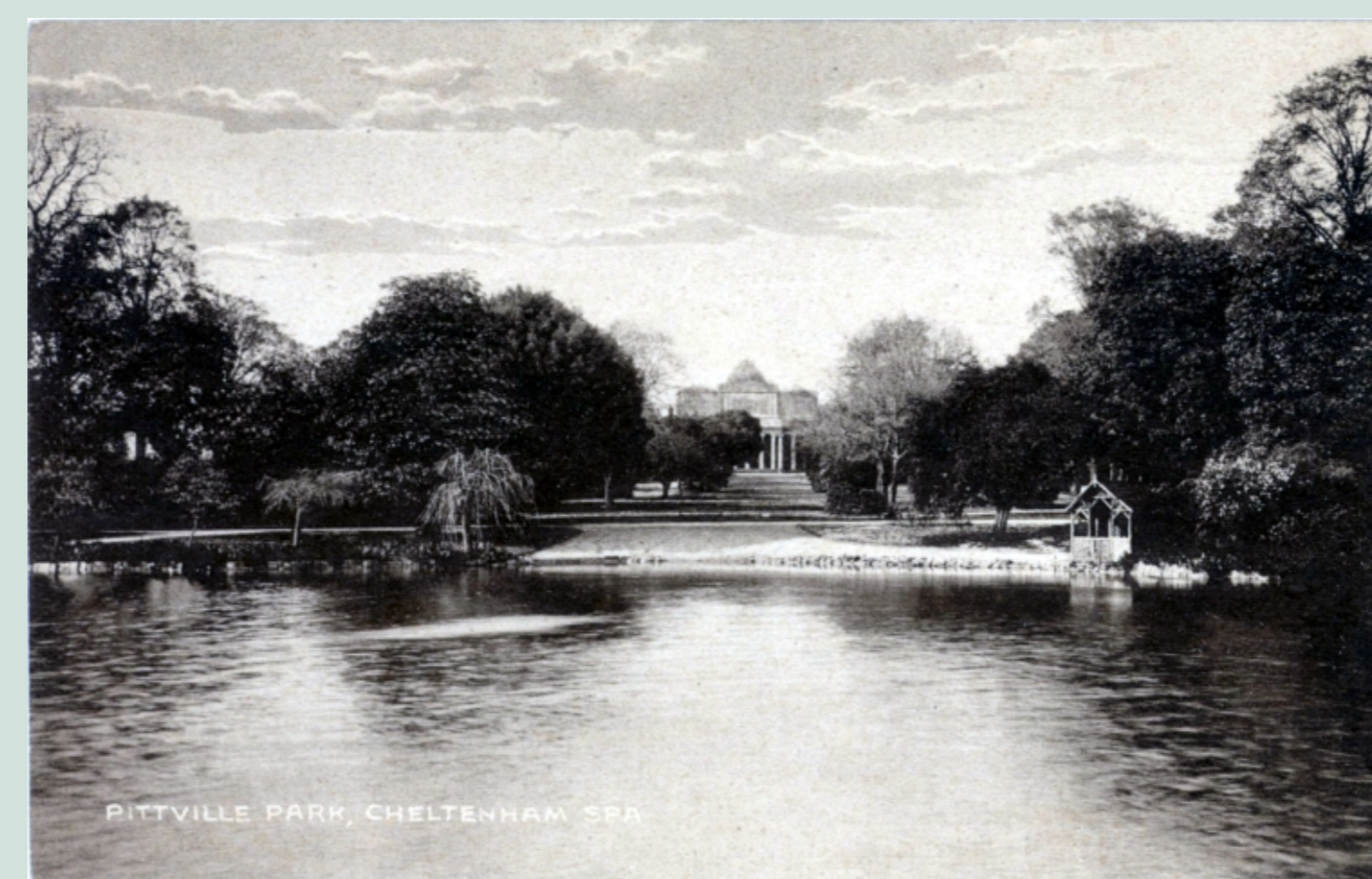
Summer house on East Lake and Pump Room, postcard circa 1900

The extensive parkland was laid out by local nurseryman, Richard Ware, in 1827. The original plan shows a 'Promenade' between the Pump Room and the lake, bordered by formal flowerbeds and overlooked by villas. This gravelled path, also known as the 'Long Walk', was grassed over after the Council's purchase of the estate in 1890.