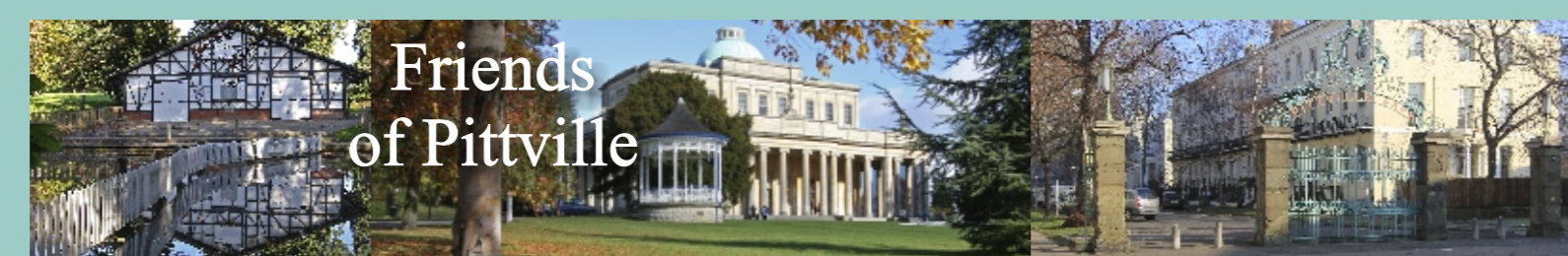
Registered charity number 1146790

The original statues were removed in 1937-39 as they were in poor condition, replaced in 1965 by copies made by Boulton & Sons of Cheltenham.