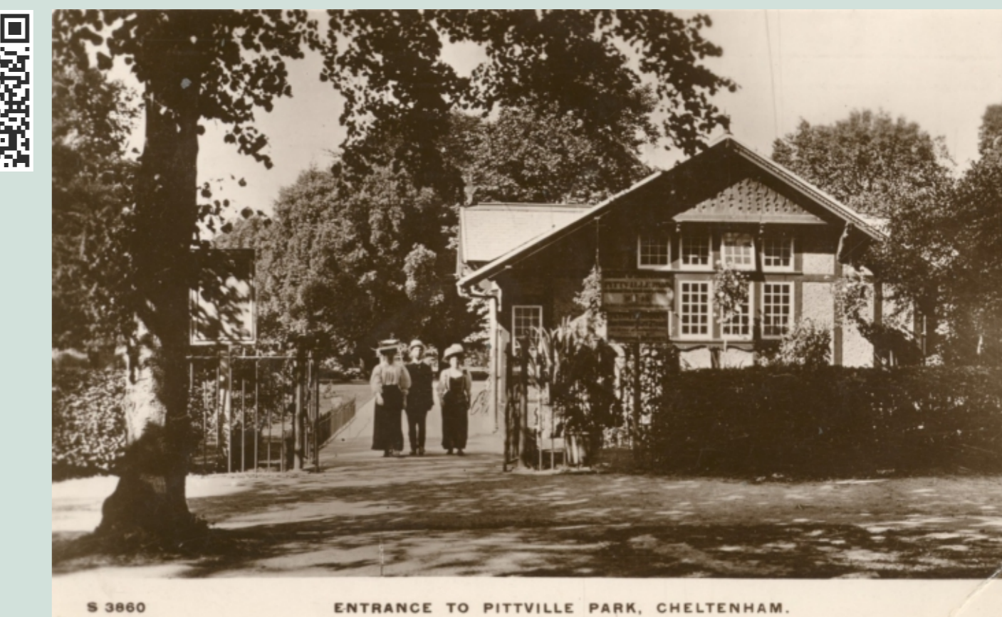
More information about an area of present day Pittville Park, not originally part of the Pittville Estate, can be found on the west side, through the underpass under Evesham Road.