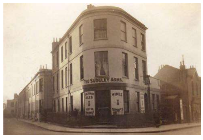
The Sudeley Arms before the entrance was moved to Prestbury Road.

Our monthly 'Drop Ins' provide an opportunity for members and others to meet on an informal basis to find out what's happening in Friends of Pittville and to give ideas and feedback to our trustees – one of whom, at least, is there each time. Dates for the next three months are 26 April, 31 May, and 28 June – the last Wednesday! Venue: The Sudeley Arms, 25 Prestbury Road, GL52 2PN, between 11.00 and 12.30.