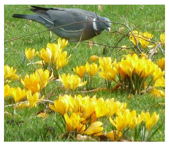
A local resident enjoying the crocuses on Pittville Circus last month.

If you do not have internet access, please call our membership secretary (01242 238 552) who will send you a hard copy of the application form.